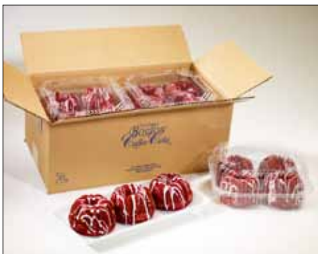
Mini Bundt Straight Pack: 16 cakes, (four 4-packs) Case dimensions: 17.25"x8.75"x6.5"