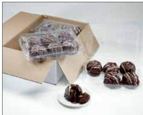
Dessert Cakes/Infusions Pack: 24 cakes, (four 6-packs) Case dimensions: 18.75"x13"x6.5"