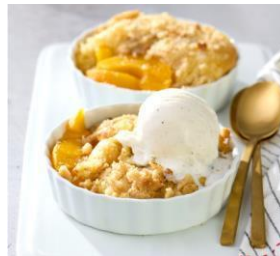
Peaches & Vanilla Cream Cobber