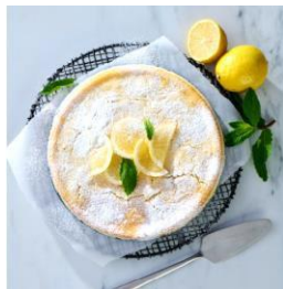
Lemon Ricotta Cake