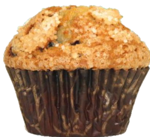
Blueberry topped with Sugar

Gross Case Weight: 9.25 Lb. Net Case Weight: 7.5 Lb. Dimensions: 15.5 x 11.9 x 7.6 Ti/Hi: 10 x 10 Cube: .81 Cf Storage: 0° or below Shelf Life Frozen: 364 days Shelf Life Ambient: 7 days