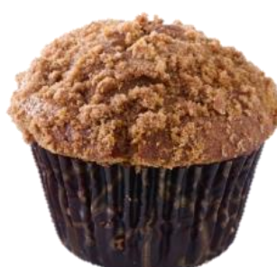
(Seasonal) Pumpkin with Cinnamon Streusel

2 wrapped trays per case for a total of 24 muffins