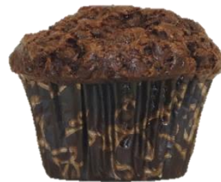
Triple Chocolate topped with chips