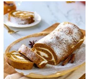
Pumpkin Swiss Roll