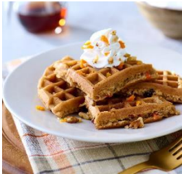
Carrot Raisin Waffles

Use UltraMoist batters to make the highest quality muffins, cornbread and loaf cakes then explore endless recipe possibilities! Visit our website for recipe ideas on how to transform a muffin at breakfast to a dessert for dinner and make appetizers, center plate inclusion and so much more!