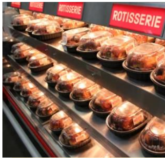
With Rotisserie Chicken