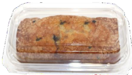
Blueberry with Sugar