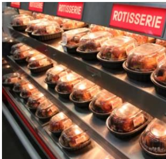
With Rotisserie Chicken