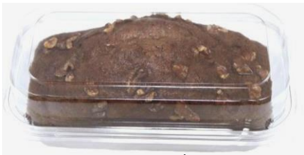
Banana Nut with Nuts