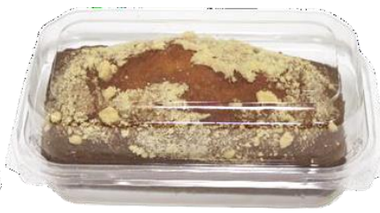
French Vanilla with Butter Streusel