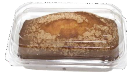
Lemon with Sugar