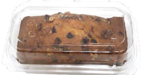
Cranberry Nut with Nuts